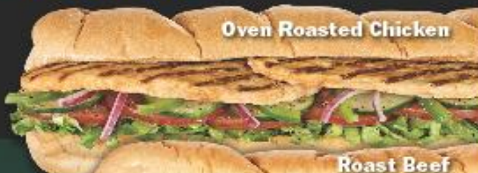
Oven Roasted Chicken