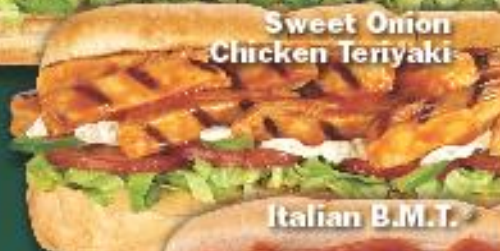
Sweet Onion Chicken Teriyaki