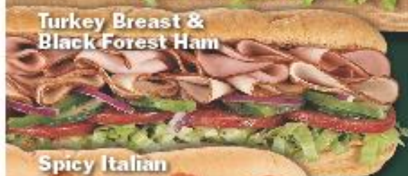
Turkey Breast & Black Forest Ham