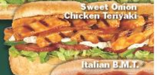
Sweet Onion Chicken Teriyaki