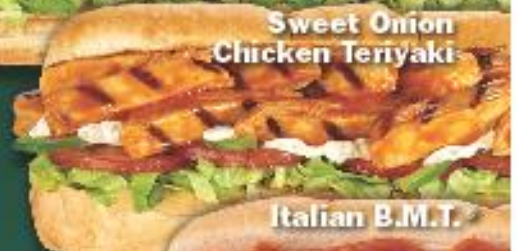
Sweet Onion Chicken Teriyaki