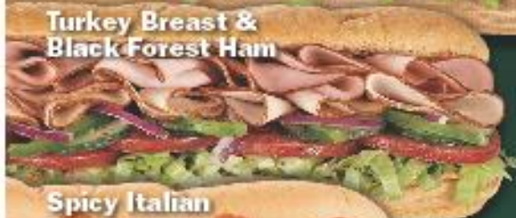
Turkey Breast & Black Forest Ham