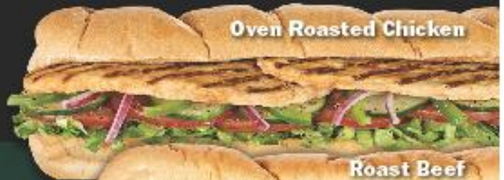
Oven Roasted Chicken