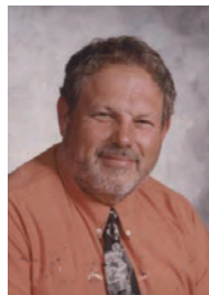
Gail Leon House